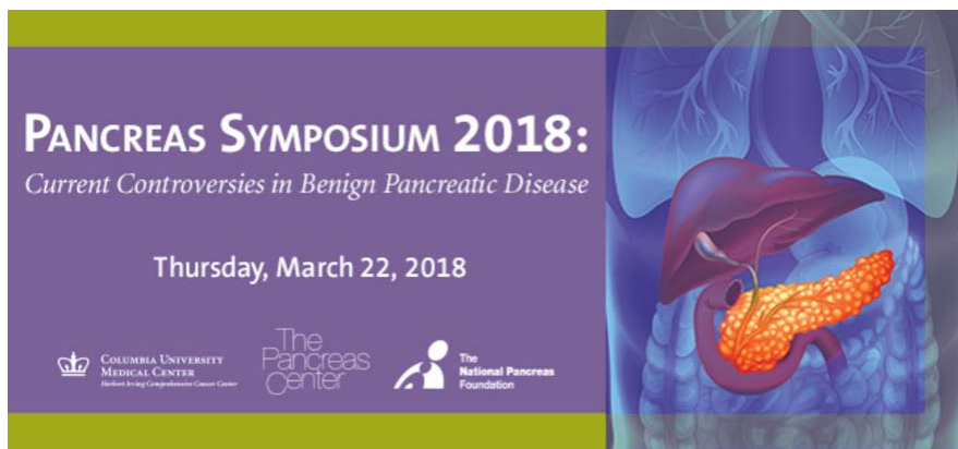
Pancreas Symposium 2018: Current Controversies in Benign Pancreatic Disease