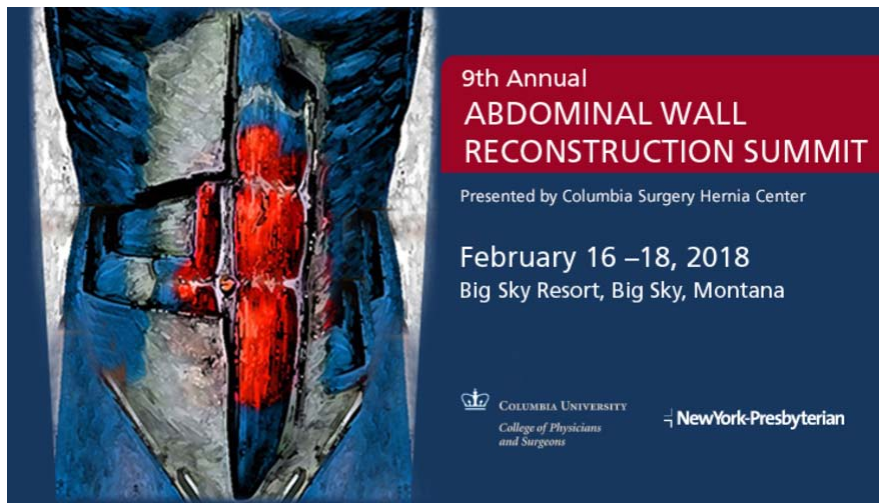
The 9th Annual Abdominal Wall Reconstruction Summit