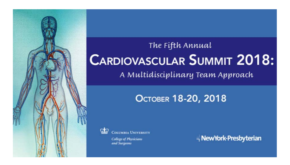
The Fifth Annual Cardiovascular Summit 2018