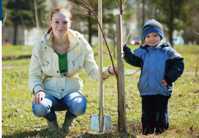
Anyone who has had open heart surgery as a child should be evaluated by a specialist in adult congenital heart disease (ACHD)

Treating ACHD requires multiple modes of treatment. For some patients, that could mean treatment with a catheter-based procedure; for others it could mean medications, electrophysiology therapy, surgery, or heart transplantation. For others, a combination of several approaches may be