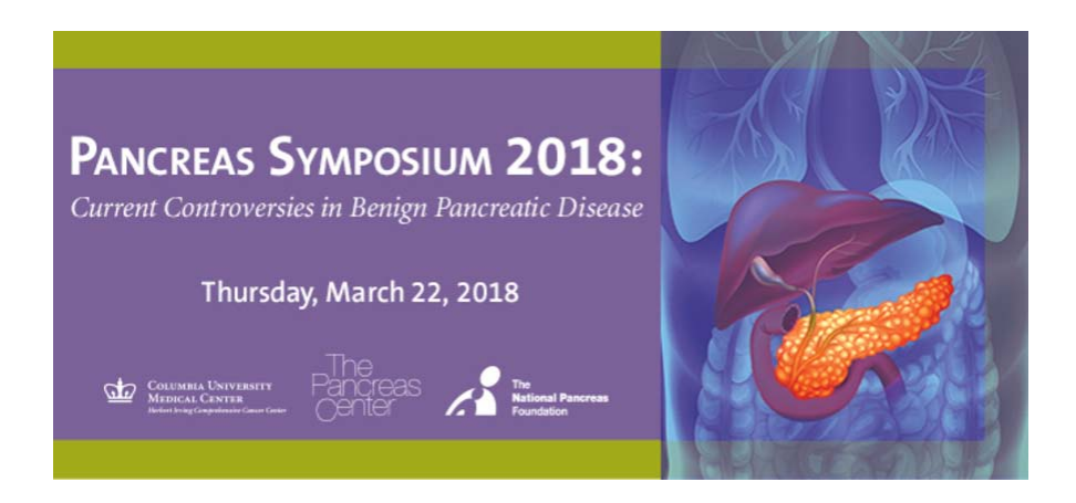
Pancreas Symposium 2018: Current Controversies in Benign Pancreatic Disease