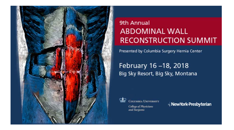
The 9th Annual Abdominal Wall Reconstruction Summit