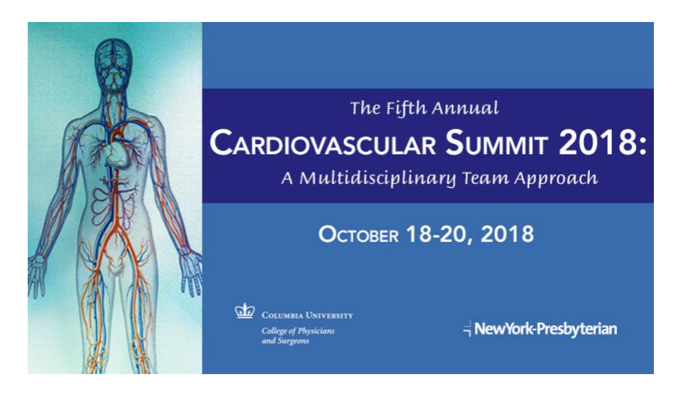
The Fifth Annual Cardiovascular Summit 2018